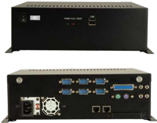
I/O panel of EB-2850G-8522