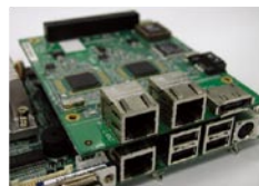
Dual GbE selection