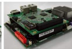
Low Profile design in NANO