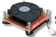
LGA1156 Cooler IEI P/N: CF-1156A-RS