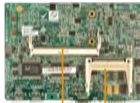
DDR2 SO-DIMM CF type I/II