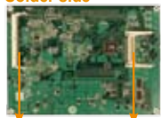
DDR2 533 CF Type II