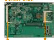
SO-DIMM CF Type II